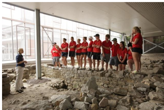
Students on The Big Dig site during an Education Program