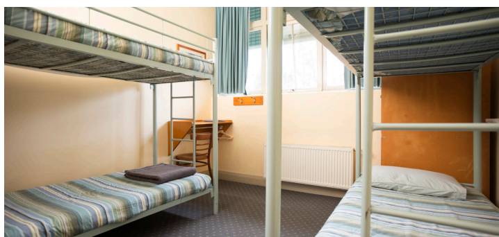
4 Bed Multi-Share Room