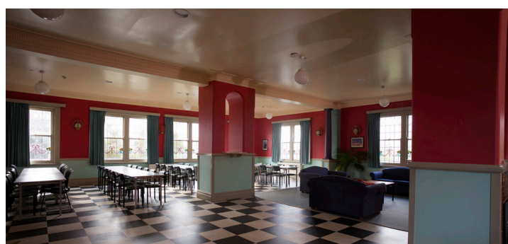
Private Lounge/Dining Room