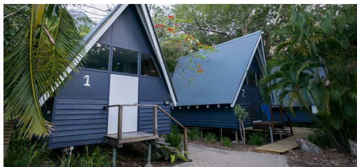
6 Bed Multi-Share Room