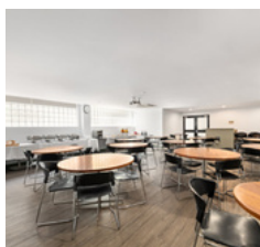
Dedicated group dining areas

YHA groups menus are thoughtfully crafted by chefs to cater to the needs of your group, with a focus on fresh, seasonal ingredients. Choose from a range of breakfast, lunch, and dinner options that fit your budget, without compromising on quality.